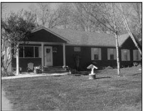
1607 Peninah St. * $152,000

Completely remodeled 3+ bedroom (just add egress to make it 4). 2-full bath, Over 1600 square feet. Finished, and close to Beadle School. Price includes new satin stainless steel appliances Lisa, Anderson Realty, LLC (605)-661-0054.