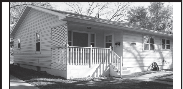
1802 Cedar, Yankton

2-Bedroom House, oak floors, high ceilings, central air, garage, microwave, garbage disposal, dishwasher, laundry, NO smokers/pets. Contact (605)660-1289.