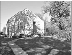
708 W. 6th

2005 4-Bedroom, 2-bath finished basement with walkout to city park (605)660-2961