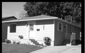
1207 Picotte * $109,900

Three bedroom, 1-3/4 bath on 1.32 acres just inside city limits. Spacious living/dining with built-ins and French doors to patio. Master bedroom with walk-in closet, master bath, main floor laundry, 2-car garage. Leona Sparks (605)660-6078. Anderson Realty.