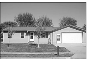
2400 Cedar Terrace

4-bedroom, 2-full bath, large yard, 2-car detached garage. Call (605)770-2950 or (605)660-7567.