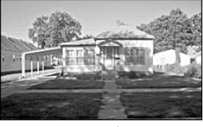
407 Pearl • $69,900

3-Bedroom, 2-Bath ranch. Remodeled kitchen and baths. Huge 1248 Sq. ft. garage. New shingles, gutters, exterior paint and concrete. Call Connie Somsen (605)661-8607 Lewis & Clark Realty