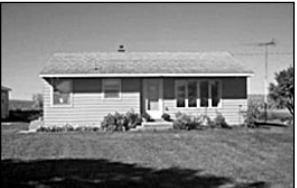
Rural Volin, SD * $44,900

House for sale: Possible rent, Springfield, beautiful riverview, 3-levels, large deck. Seller financing available, (605)661-1737.