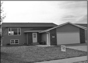
621 Sawgrass $179,990

2-bedroom, 1-bath, Cozy home, carport, huge garage off alley. Joe, Americas Best Realty. (605)661-7264.