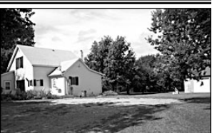
1.32 Acres in Town 1500 Dakota St. * $99,000

Spacious 4-bedroom, 2-bath home. Beautifully updated kitchen/baths, hardwood floors, woodwork. Erica (605)660-2992 Anderson Realty.