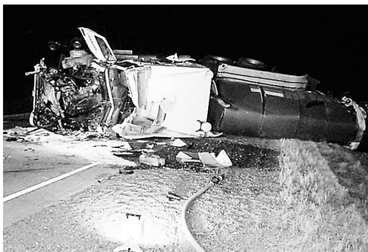
One person received what were reported to be minor injuries during a three-vehicle accident on Highway 81 about 1 1/2 miles north of the intersection with Highway 46 early Friday morning.