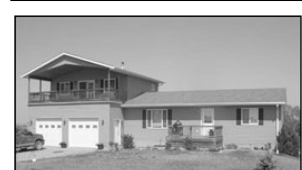
42507 Songbird Rd. Taber, SD - $232,000 3-bedroom, 2-bath on 12 acres of land.

Wonderful charming country home on 8+ acres just minutes from Yankton.