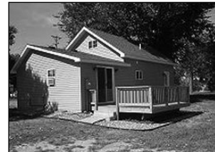
Like new, rebuilt 2 bedroom-1 1/2 bath home on two city lots next to city park in Lesterville.

Lake view house, 1700 sq.ft. ranch, 3-bedroom, 3-car garage, walk out basement, on 2 acres.