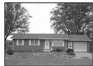
107 Anchor Dr. $129,900 Very nice 5-bedroom home, updated kitchen/baths.