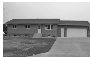
100 Tootys $149,900 Great remodeled newer home on 1/2 acre.

1-Bedroom, full basement, new roof, new kitchen & appliances. New bathroom, quiet neighborhood.