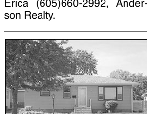
1309 Pearl $117,500 Great 3-bedroom home, finished basement, double garage.