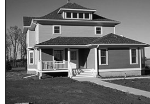
30674 447th Ave. Mission Hill Wonderful charming country home on 8+ acres.

Wonderful charming country home on 8+ acres just minutes from Yankton.