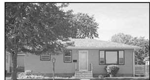
1309 Pearl $117,500

Summit Heights home with many upgrades including crown molding, tray ceilings, granite countertops, stainless steel appliances and more. $330,000. Rob (605)661-1591. www.yankton.net/1302w17th/