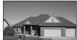
1302 W. 17th

3-bedroom 2-bath house with 3/4 finished basement, double car garage. Updates inside and out, a must see! (605)661-2033 or ( 6 0 5 ) 6 6 0 - 4 7 4 9 . yankton.net/107e9th/