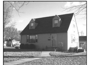
107 E. 9th $110,00

Very nice 5-bedroom home, updated kitchen/baths, spacious yard, move-in ready! Erica (605)660-2992, Anderson Realty.