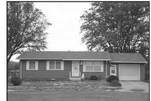
107 Anchor Dr. $129,900