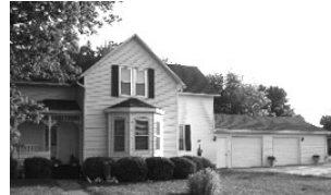
204 Brown St., Gayville Reduced • $136,000