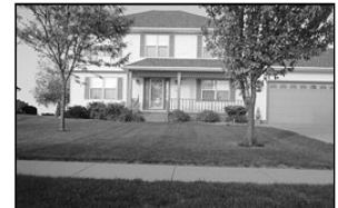
2705 Mulligan Drive $290,000

4-Bedroom 2-full bath. Home Warranty (605)660-7537 www.yankton.net/204brown/