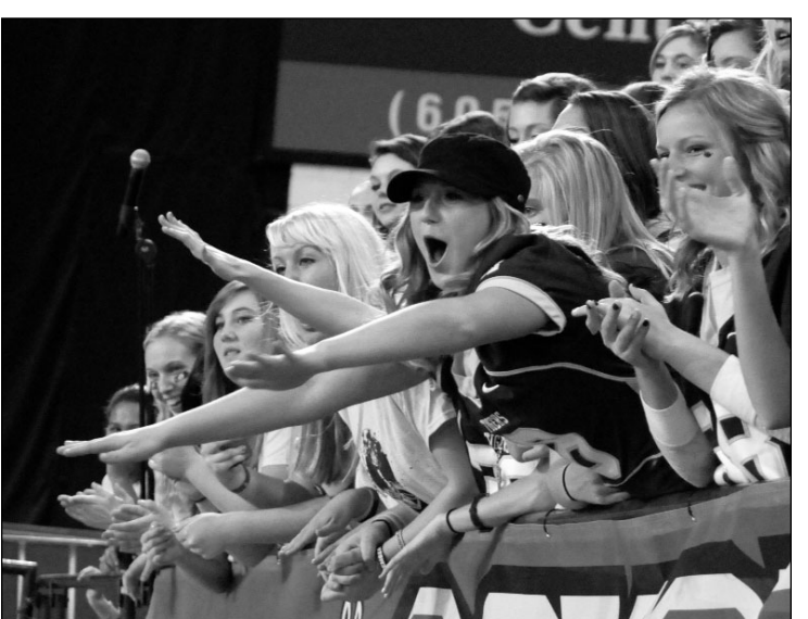
A Harrisburg fan signals "no catch" to a Dell Rapids player after an incomplete pass during the Class 11A championship game.