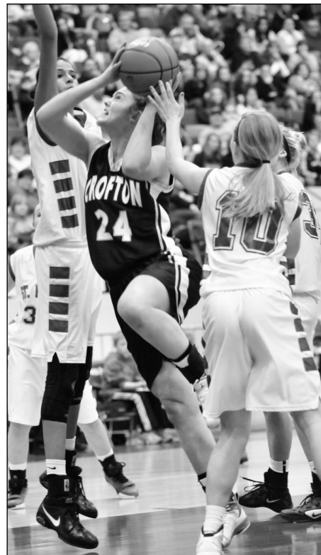
P&amp;D FILE PHOTO

Walker and Reeg join a program that won five consecutive matches to cap the regular season. The Coyotes finished 14-14 overall and 8-8 in Summit League play.