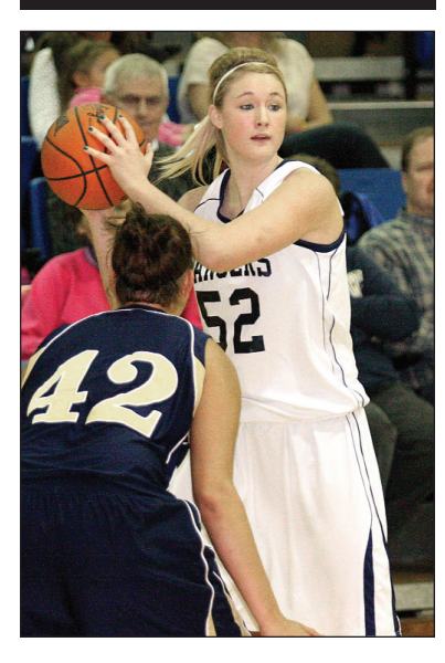
Mount Marty Women Fall At Home