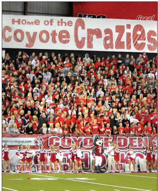
The student crowd at the University of South Dakota cheers on the Coyotes during a home game this season at the DakotaDome in Vermillion.

Area Fans Pumped Up For The USD-SDSU Football Game, Which Is Being Played For The First Time Since 2003