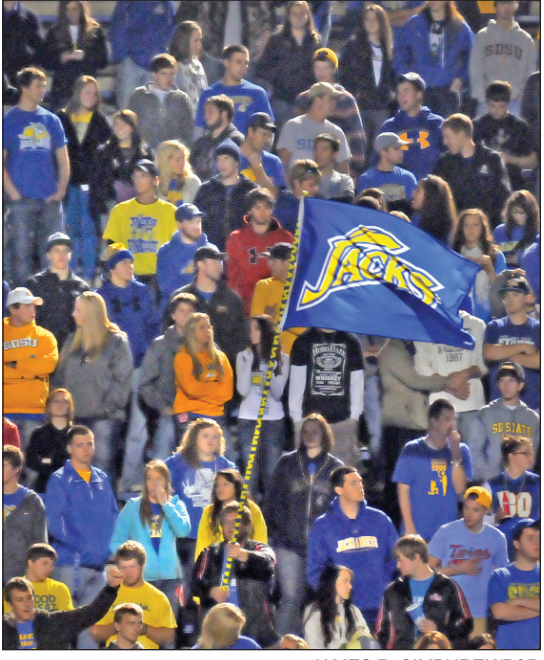
A South Dakota State flag is brought out during an Oct. 13 home game at Coughlin-Alumni Stadium in Brookings. The Jackrabbits will host USD today (Saturday) at 2 p.m.