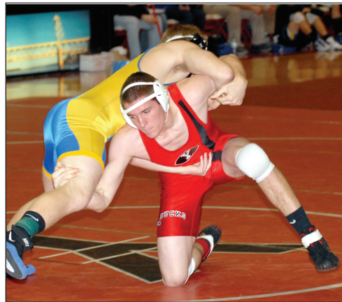
YHS Wrestlers Set For New Season • 7