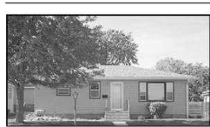
1309 Pearl Price Reduced • $112,500

3-bedroom, 2-baths, beautifully remodeled home, 3-season room, large garage. Kelly, America's Best Realty (605)260-1600.