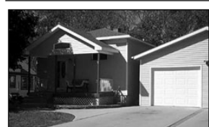
1107 Redmond • $129,000

3-bedroom, 2-bath, beautiful kitchen. Large family room, 2-stall garage, natural gas. (605)661-9078.