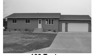
100 Tootys $149,900

Great remodeled newer home on 1/2 acre. 3-bedroom, 2-bath, attached 2-car garage, huge deck! Ginny, Anderson Realty, LLC (605)661-6031.