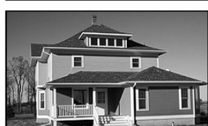
30674 447th Ave. Mission Hill