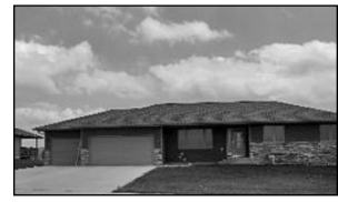
Price Reduced 2912 Masters

New Townhomes on Fox Run Golf Course. 605-760-4712 • View at www.yankontownhomes.com