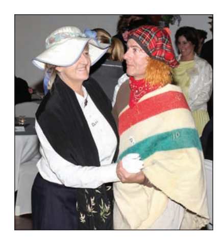
ABOVE AND RIGHT: Saturday night's public dance drew a big crowd, including several people who were dressed in historic attire from various phases of Yankton's history.