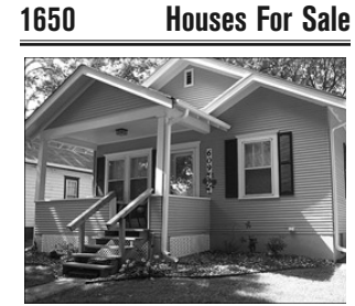
609 Green * Yankton $105,000

Close to Lake Francis Case. Kelly Filips, America's Best kfbest@iw.net (605)660-0900; (605)260-1600