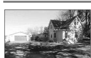
136 E. Turner - Irene $89,900

4-bedroom, 2-bath with lots of room. Joe (605)661-7264 America's Best Realty.