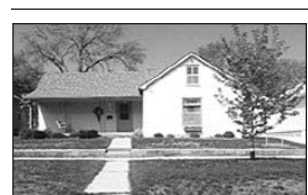
505 Green - $74,900

8-Condo's one price. Great investment property. Kelly, America's Best Realty (605)660-0900.