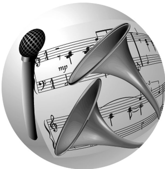
The Mount Marty College fall band concert will be held at 7:30 p.m. Sunday at Marian Auditorium in Yankton.