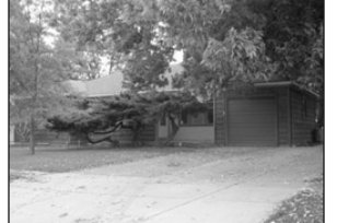
511 Missouri • Pickstown, SD $164,000

3-bedrooms, wood fireplace. Close to Lake Francis Case. Kelly Filips, America's Best Realty. kfbest@iw.net (605)660-0900; (605)260-1600