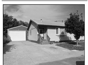
304 Wicker St. Gayville - $146,000