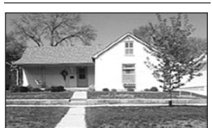
505 Green - $74,900

1,800 sq.ft. finished ranch, completely remodeled 2006. 40x26 metal storage building with attached 26x40 3-car garage with man cave new in 2010. (605)661-7670, http://www.yankton.net/app/html/304wicker/