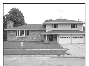
911 W. 12th St. $189,000

3-bedrooms, wood fireplace. Close to Lake Francis Case. Kelly Filips, America's Best Realty. kfbest@iw.net (605)660-0900; (605)260-1600