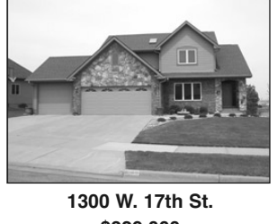
1300 W. 17th St. $329,000

1-1/2-story, 5-bedrooms, 3-1/2 baths, 3-car garage, corner lot in Summit Heights. Immediate possession. (605)661-1799 for viewing or more information http://www.yankton.net/app/html/1300w17th/