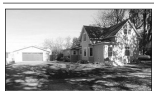
136 E. Turner - Irene $89,900

1-1/2-story, 5-bedrooms, 3-1/2 baths, 3-car garage, corner lot in Summit Heights. Immediate possession. (605)661-1799 for viewing or more information http://www.yankton.net/app/html/1300w17th/