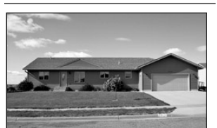
2919 Masters $269,900

4-bedroom, 2-bath with lots of room. Joe (605)661-7264 America's Best Realty.