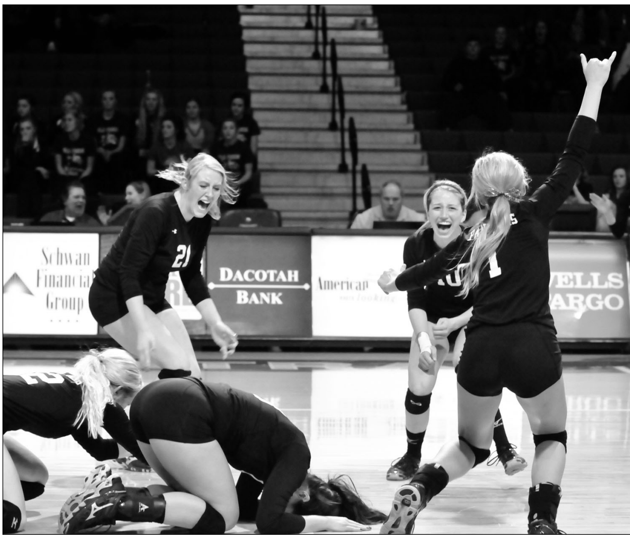
Dakota Valley players celebrate their 5-set semifinal win over Sioux Falls Christian at the S.D. State Class A Volleyball Tournament on Friday at Aberdeen Central High School.