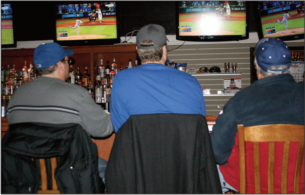
Fans take in Game Seven of the 2014 World Series at Ben's Brewing Co. Wednesday night between the San Francisco Giants and the Kansas City Royals. The Giants defeated the Royals 3-2.