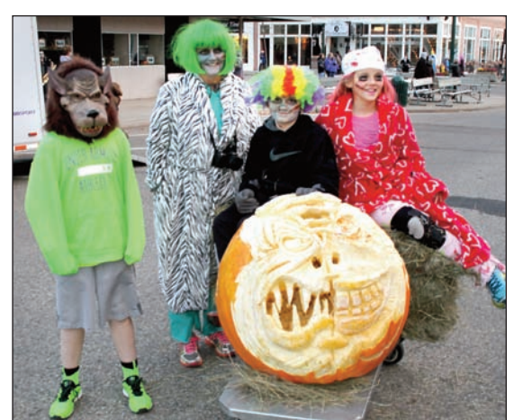
LEFT: A member of the Yankton High School marching band turned part of Friday's Zombie Walk into an episode of "The Drumming Dead." ABOVE: These slightly undead candy-seekers were part of the fun of the Press & Dakotan's annual Spotted Halloween event — Ghoul's Gathering — at the Riverfront Event Center. RIGHT TOP: This impressively carved and impressively massive pumpkin (and its friends) showed up to take part in the Zombie Walk in downtown Yankton at sunset Friday night. RIGHT BELOW: Spongebob Squarepants and his pal Patrick came ashore to take in some of the festivities at Yankton's Harvest Halloween Festival Friday. A costume ball featuring The Lugnuts was held Friday night. More activities are planned in the downtown area today (Saturday). To see or purchase images from Friday's events, visit spotted.yankton.net .