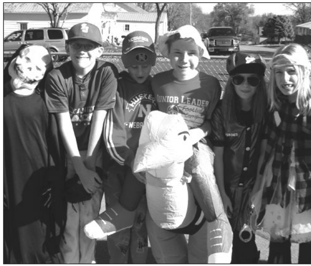
Beadle Elementary School in Yankton held a costume parade on Halloween, inviting parents, relatives and friends to enjoy all the creative costumes on display.