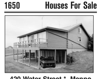
420 Water Street * Menno $130,000

FOR SALE: Now building homes in Summit Heights, Hillcrest East and Quarry Pines. Call Jim or Jason Tramp for details. (605)661-2191 (605)661-2192.