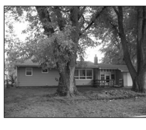
502 8th St. * Springfield $75,000

Hand built log cabin with 2 bedrooms + Loft-sleeper. 2 baths. Basement walk-out 3.7-5 acres. Call Emma Laird, Lewis & Clark (605)661-2224.