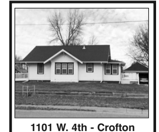
$58,500 Jpdated 2-3 bedroom, 1/2

Charming 3-bedroom, 2-bath home is centrally located in Rick, Anderson Yankton. Realty. (605)760-9976.