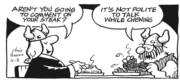
HÄGAR THE HORRIBLE | CHRIS BROWNE