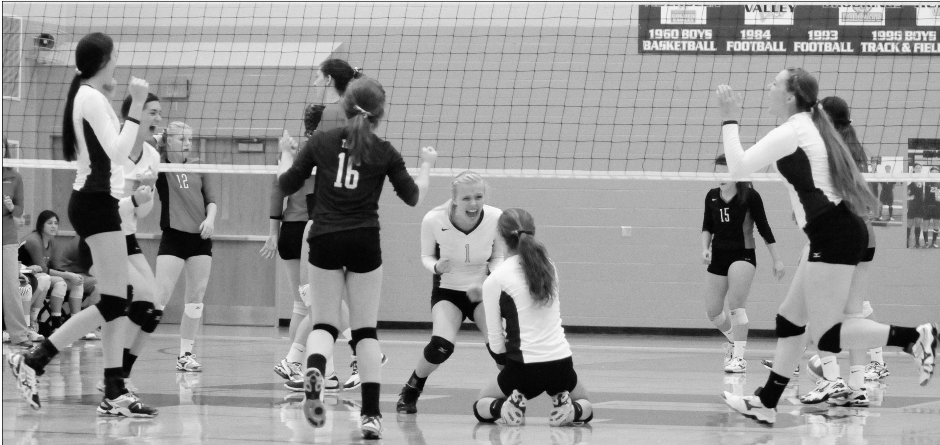
The Harrisburg Tigers celebrate their victory over Yankton in the District 2AA volleyball tournament. Harrisburg is making its State AA Volleyball Tournament debut when the event opens today (Thursday) at the Summit Center in Yankton.