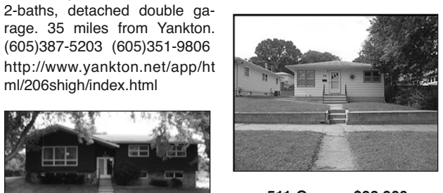
511 Green · $93.900 2-bedroom, 1-bath home.

Hand built log cabin with 2 bedrooms + Loft-sleeper. 2 baths. Basement walk-out 3.7-5 acres. Call Emma Laird, Realty Lewis & Clark (605)661-2224.