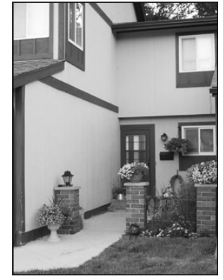
905 E. 15th #3 • $89,900

Close to schools/parks. Joe, America's Best (605)661-7264.