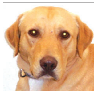
(605) 664-4244 or e-mail hhs@midconetwork.com . Visit the Humane Society's website at www.heartlandhumanesociety.net .