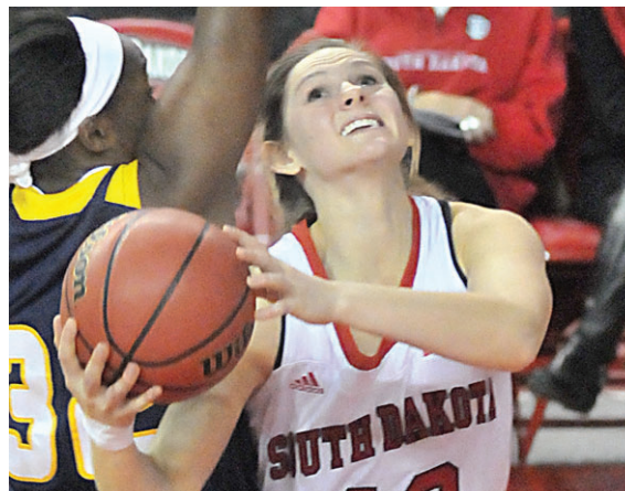
USD Women Roll UC-Irvine In First Home Game Of The Year ■ Page 7