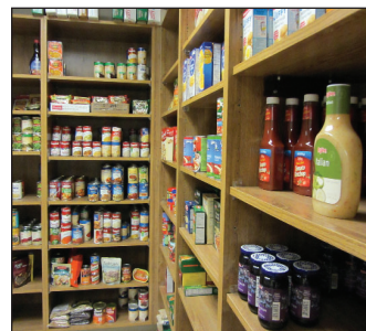
Mount Marty College students recently brought non-perishable food they collected for the Food Pantry, another program offered at the Contact Center. Squashes in grocery carts for all came from a gardener's bountiful harvest. "Food for Fines" is a Yankton Community Library alternative for library patrons. Items go to the Food Pantry.