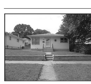
511 Green • $89,900

6-bed, 4-bath, view of Lake Alexis. Kathy Youngberg, Century 21 (605)661-0389