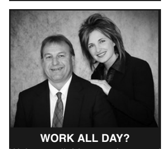
We're available evenings and reekends as well. For all your eal estate needs.

Now building townhouses at 602-606 Sawgrass Street. 1,229 sq.ft.+/- units with 3 bedrooms, 1.5 baths, attached 2-car garage, covered patio. (605)661-8003 or (605)661-2400.