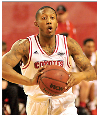
USD Men Top WSC • PAGE 6A