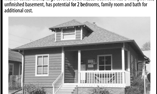
402 W. 5th St. • $99,900

2BR, 1BA could be your personal residence or your business or as a residential or commercial rental. Large covered patio, original wood floors and trim. Large open living and dining areas, spacious walk-up attic could be finished for living space. Basement provides plenty of storage or workshop possibilities. Well maintained with new siding, shingles and gutters in 2012. Cleaning business could be bought with property for additional cost, or be purchased separately.