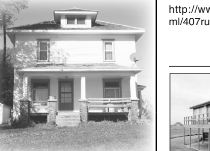
420 Water Street * Menno $130,000

Hand built log cabin with 2 bedrooms + Loft-sleeper. 2 baths. Basement walk-out 3.7-5 acres. Call Emma Laird. Lewis & Clark (605)661-2224.