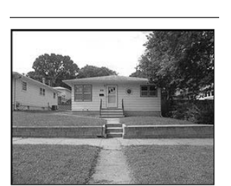
511 Green · $89.900

Hand built log cabin with 2 bedrooms + Loft-sleeper. 2 baths. Basement walk-out 3.7-5 acres. Call Emma Laird. Lewis & Clark (605)661-2224.