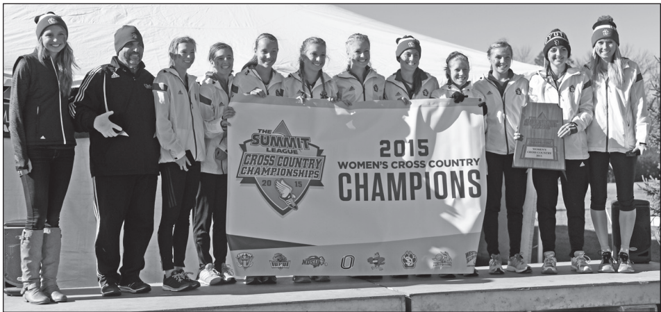
The South Dakota women's cross country team takes the awards stand after receiving the championship trophy for winning the Summit League Cross Country Championships on Saturday in Brookings. It was the Coyotes' second straight league title.