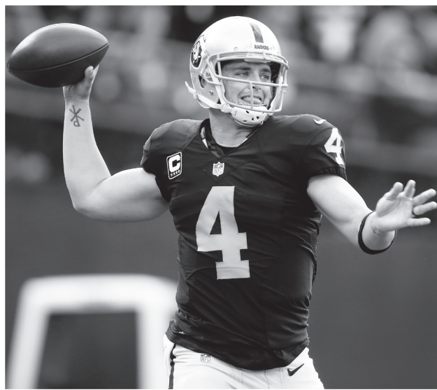
Oakland Raiders quarterback Derek Carr (4) throws against the New York Jets during the third quarter on Sunday at O.co Coliseum in Oakland, Calif. Oakland plays Minnesota this coming Sunday.