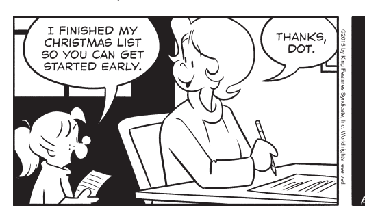
FOR BETTER OR FOR WORSE | LYNN JOHNSTON