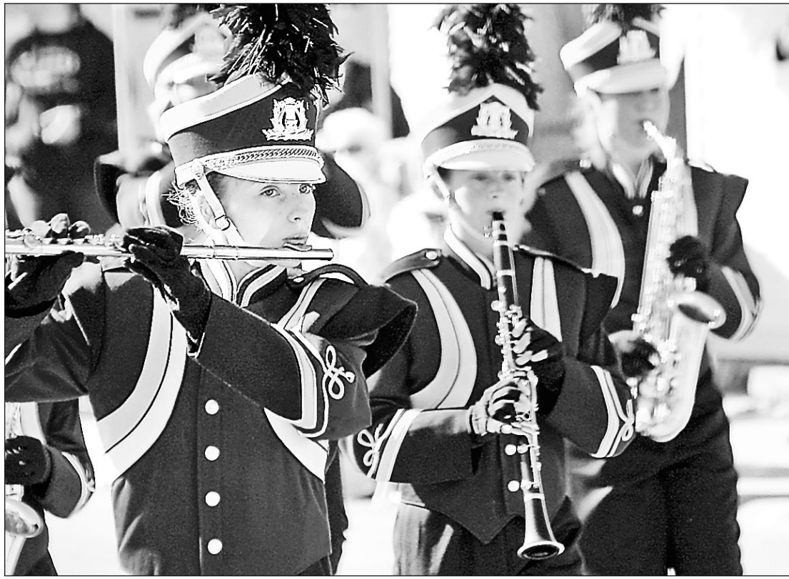
Members of the Menno High School marching band perform "December 1963" while performing during the fifth annual Menno Band Day competition Friday. More than 20 bands competed in high school and middle school divisions. Plus, the Northern State University marching band was also on hand to perform. Menno won its division. Final results from Friday's competition are on this page. To see or purchase images from this event, visit spotted.yankton.net .