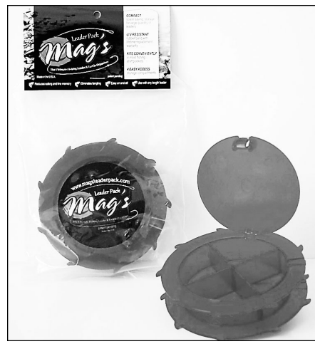
Mag's Leader Pack allows the angler to easily store their one and two-hook walleye snells, allowing anglers to quickly replace the snell and get back to fishing.

Since waterfowl hunters operate in wet conditions, they need to keep their powder