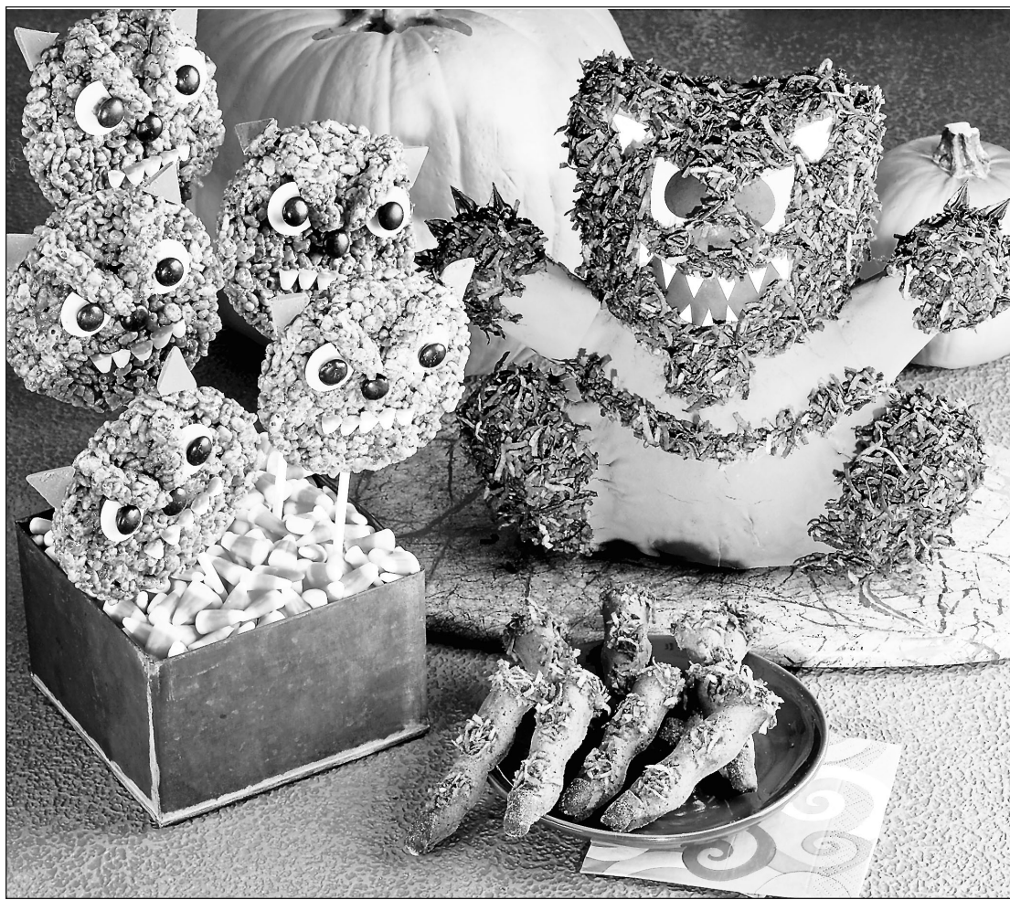
Clockwise from upper left: Wickedly Wonderful Werewolf Pops, Frightfully Fun Werewolf Cake and Werewolf Furry Finger Cookies

place coconut with icing color; knead until color is evenly blended. Dry on parchment or waxed paper. Attach in small clumps on cooled cookies with melted candy. Roll out spice drops on surface sprinkled with granulated sugar; cut into finger-nail shapes. Attach to cookies with melted candy.