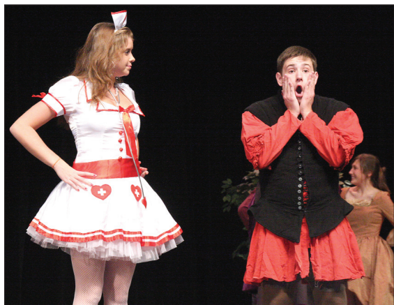
'Romeo And Juliet' Meets Its Match In YHS Comedy River City