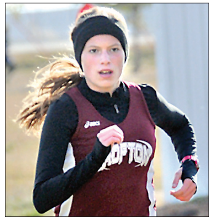
Crofton Girls Win District XC Title • 7A