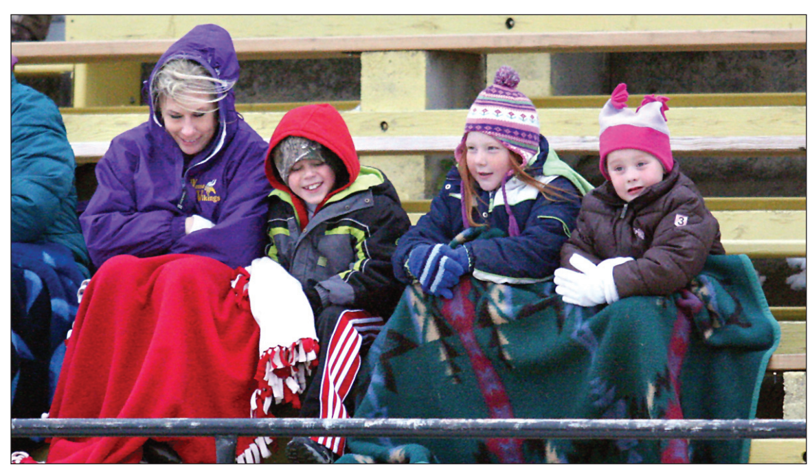
These Wausa fans bundled up as the arrival of the Nebraska football playoffs was greeted with wintry conditions Thursday. Approximately 3 inches of snow fell in Wausa, forcing crews to clear the field of snow before the hometown Vikings could host Bancroft-Rosalie in the first round of the Class D2 playoffs. For results from Thursday's games, see page 7A.