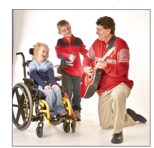
Entertainer Set To Give Yankton A 'Snow Day' • 1B