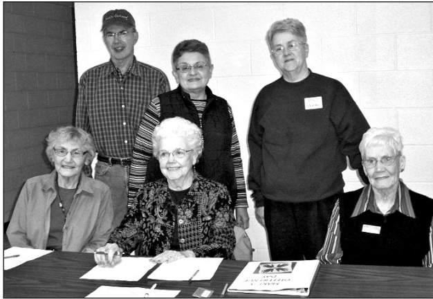
PHOTO: UNITED WAY RSVP volunteers join the action on 2012's Make A Difference Day, the nation's largest day of community service.

In preparation for this event, an Annual Community Collection Drive is conducted. Community members are being asked to drop off gently used and clean winter coats, boots, snow pants, and winter hats and gloves to the Boys & Girls Club, Payless Shoes, Maurice's or Avera Sacred Heart Hospital, main lobby entrance through Oct. 18. School aged students can drop off their donations to their local school from Oct. 14-