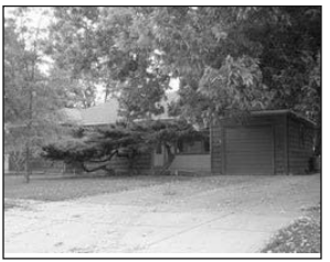
511 Missouri • Pickstown, SD $167,500

8-Condo's one price. Great investment property. Kelly, America's Best Realty (605)660-0900.