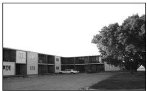
301 W. 31st

4-Bedroom, 2-full bath, 1881 square feet, 2+ car garage. (605)660-7537 www.yankton.net/app/html/204brown/