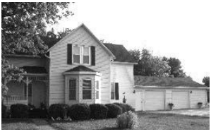
204 Brown St., Gayville For Sale by Owner $137,000