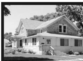
417 Locust $119,900

3-bedroom, 1-1/2 bath, brick home. Large rooms, corner lot. Emma, Century 21 (605)661-2224.