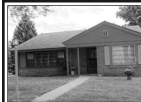
309 E. 9th Price Reduced * $109,500

8-Condo's one price. Great investment property. Kelly, America's Best Realty (605)660-0900.