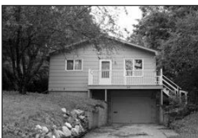
804 Pine • $105,000

3-bedrooms, wood fireplace. Close to Lake Francis Case. Kelly Filipis, America's Best Realty. kfbest@iw.net (605)660-0900; (605)260-1600