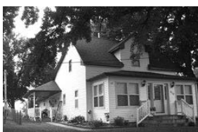
510 W. Harold-Crofton 99,500

Lewis & Clark Realty www.yanktonareahomes.com