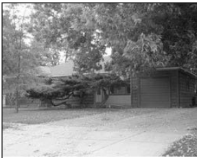
511 Missouri • Pickstown, SD $167,500

3-bedrooms, wood fireplace. Close to Lake Francis Case. Kelly Filipis, America's Best Realty. kfbest@iw.net (605)660-0900; (605)260-1600