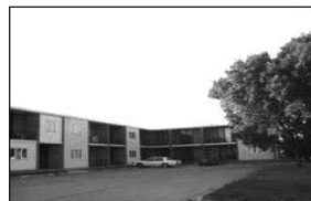
301 W. 31st

1-1/2-story, 5-bedrooms, 3-1/2 baths, 3-car garage, corner lot in Summit Heights. Immediate possession. (605)661-1799 for viewing or more information http://www.yankton.net/app/ht/ml/1300w17th/