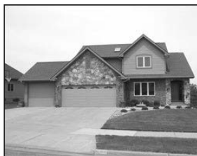
1300 W. 17th St. $329,000

Newly constructed home 4-Bed, 2-bath, attached 2-stall garage, vaulted ceilings, modern look. Call (605)951-6304.