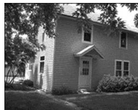
106 N. Janda, Tabor $69,000