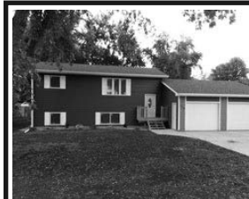
116 Forrestview Drive, (Timberland Park) Yankton, SD

Everything on main floor, 2-bedrooms upstairs. New siding, paint, windows and doors. Max (605)661-8434, Anderson Realty, LLC