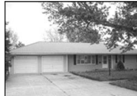
1009 1st St. • Crofton Price Reduced $94,900