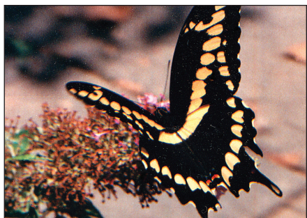
HAVE A PHOTO? Submit it to River City for publication in this space: RiverCity@yankton.net.