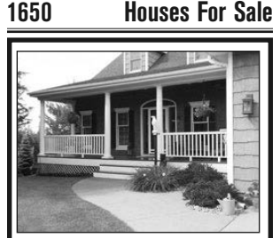
120 Crest Ridge Rd.

665-4999 Yankton North • 2105 Broadway Avenue firstdakota.com Member FDIC