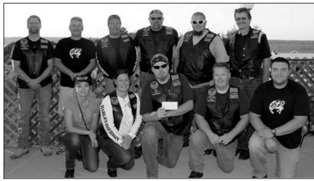
The Lewis and Clark Fire and Iron Motorcycle Club, in conjunction with the Upper Deck's third annual Poker Run for the Yankton Sack Pack Program, presented a check to Southeast CASA in the amount of $9,000.