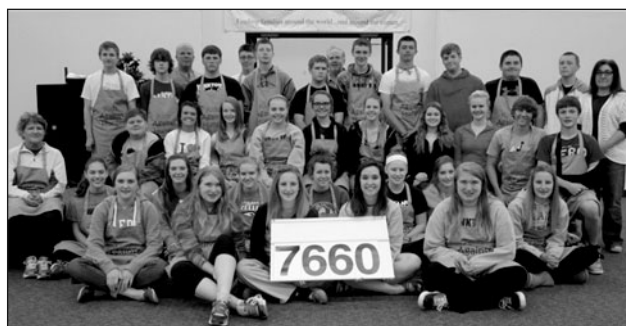
The St. Ben's Catholic Church 9th graders and sponsors recently packed over 7,600 meals for children in need. If you would like to learn how you can make a difference, please visit www.kahyankton.org