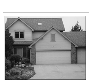
117 Lookout Trail

3-bedroom, 1-bath. Perfect starter home. Wayne, Century 21, (605)760-0780.