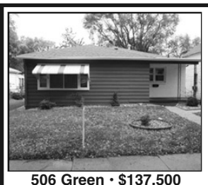
506 Green • $137,500

_arge 3+ bedroom, 2-baths, 2-car garage. Contract for deed with down payment. Lisa Anderson Realty, LLC (605)661-0054.