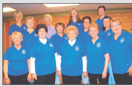
The Rivercity Harmony, Sweet Adelines prepare for annual fall show "Swingin' to the 50s" on Sunday Oct. 26, 2014. The group has been active in the musical community for the past 38 years.