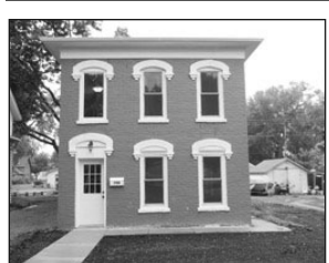
708 Douglas Ave. • Yankton PRICE IMPROVED • $129,000

This 3-bedroom, 2-bath home was completely renovated from the studs up! Almost 2,000 finished square feet. Call Brad Dykes 605-660-1414. Shore to Shore Realty, LLC.