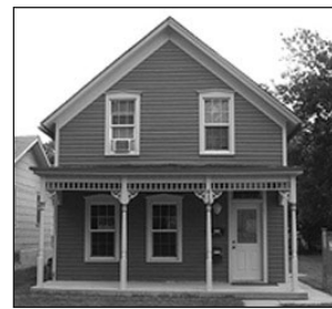
412 Douglas • Historic Home Open House