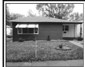
506 Green • $137,500

3-bedroom, 2-bath, ranch, new flooring/paint. Jolene, Century 21 (605)464-9634.