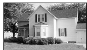
204 Brown St • Gayville $137,000

Beautiful 2 story home 4-bedrooms, formal dining, large kitchen, main floor laundry and oversized garage. Call Brad Dykes (605)660-1414. Shore to Shore Realty, LLC.