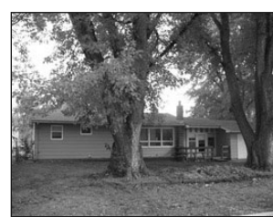
502 8th St. • Springfield $75,000

Saturdays 12Noon-4pm 3-bedroom, 2-bath, 1,250 sq.ft., storage building, 2-car garage, price reduced. (605)665-0954. 20K yearly business available separately. http://www.yankton.net/app/ht/ml/412douglas/