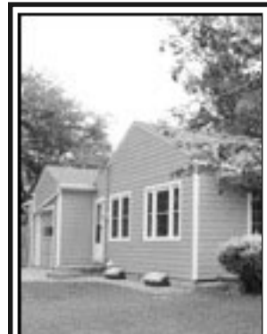
2108 Douglas • $139,900