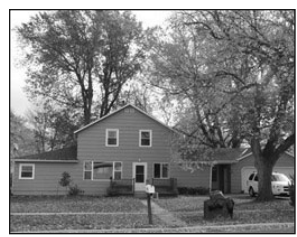
712 Walnut, Springfield $93,500

This 3-bedroom, 2-bath home was completely renovated from the studs up! Almost 2,000 finished square feet. Call Brad Dykes 605-660-1414. Shore to Shore Realty, LLC.