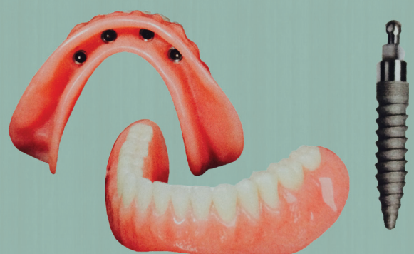
A low-cost removable denture is anchored by a simple and effective O-ring retention system. It is intended for patients who do not receive conventional implants due to medical, anatomical, or financial reasons.