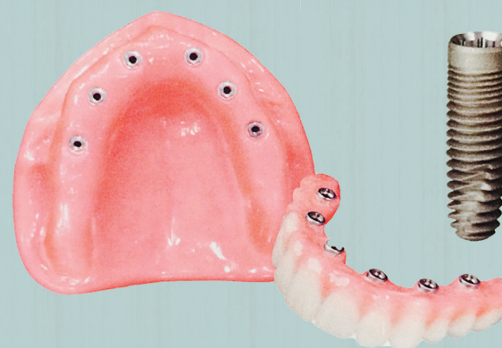
A fixed prosthesis (removable only by the doctor) is attached to four or more implants by way of titanium framework. It is intended for patients desiring maximum stability, esthetics and function.

Dental Implants fuse with the jawbone offering firm support to man-made teeth. Dentures, bridges and single teeth attached to implants, will not slip or shift in your mouth. This is a very important benefit when eating or speaking. This secure fit also helps man made teeth feel more natural than typical bridges or dentures. Dental implants are a great value because they can last a lifetime with good care.