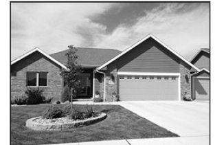
804 Rylee Way $326,900 5-bedrooms, 3-baths. Built in 2012. 1/2 block from Hillcrest Golf Course. Dark birch woodwork, maple floors, great patio. (605)660-1013 kbietz95@gmail.com http://www.yankton.net/app/ht/ml/804rylee/