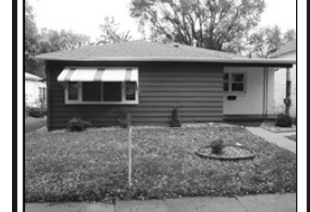
506 Green • $137,500 Large 3+ bedroom, 2-baths, 2-car garage. Contract for deed with down payment. Lisa Anderson Realty, LLC (605)661-0054.