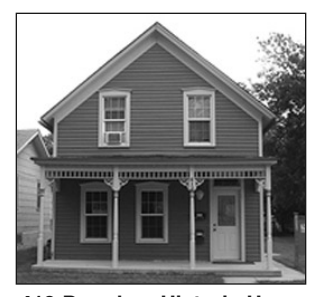
412 Douglas • Historic Home Open House Saturdays 12Noon-4pm 3-bedroom, 2-bath, 1,250 sq.ft., storage building, 2-car garage, price reduced. (605)665-0954. 20K yearly business available separately. http://www.yankton.net/app/ht/ml/412douglas/