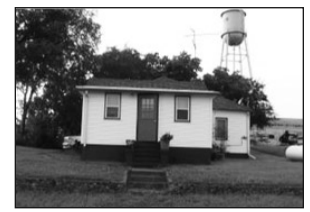
103 Dace Street • Volin $43,900

3-bedroom, 1-bath. Perfect starter home. Wayne, Century 21, (605)760-0780.