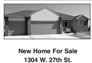
New Home For Sale 1304 W. 27th St. 1555 square foot, 3 bedroom, 2 bath, open floor plan, covered front porch and rear deck. Ceramic tile in kitchen and baths, granite countertop and Starmark cabinetry. List Construction (605)661-8003.