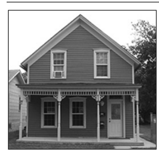
412 Douglas • Historic Home Open House Saturdays 12Noon-4pm 3-bedroom, 2-bath, 1,250 sq.ft., storage building, 2-car garage, price reduced. (605)665-0954. 20K yearly business available separately. http://www.yankton.net/app/ht/ml/412douglas/