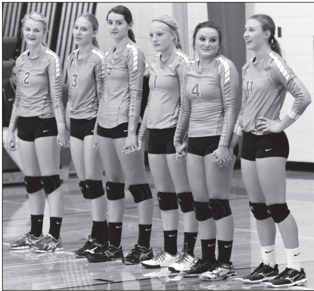
The Bon Homme Cavaliers prepare to take the floor during a home match earlier this season. The Cavaliers are 15-4 on the season, and host Menno tonight (Thursday).

And now this season, Bon Homme – even with three consecutive losses – is off to a 15-4 start and has, according to coaches and players, used its strong chemistry to bolster the program's expectations.