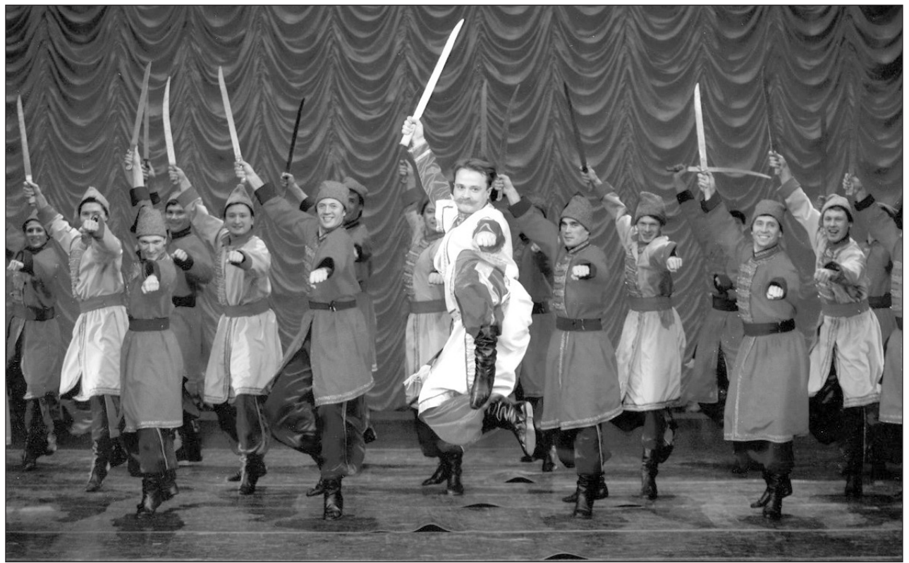
The Krasnoyarsk National Dance Company performs at the YHS/Summit Activities Center theatre Tuesday, Oct. 6.

I absolutely couldn't get enough of this book. I raced through it, knowing that it would be satisfying but that the ending might not be rosy. If you've ever been a patient, I think you'll like it too, so look for it. Missing "The Shift" would be a bitter pill to swallow.