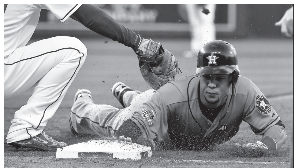
Houston Astros pinch runner Carlos Gomez is picked off by the tag from Kansas City Royals first baseman Eric Hosmer in the ninth inning in Game 2 of the ALDS on Friday, Oct. 9, at Kauffman Stadium in Kansas City, Mo. The Royals won, 5-4, to tie the series.

Kelvin Herrera (1-0) and Ryan Madson each tossed a scoreless inning for the Royals. and